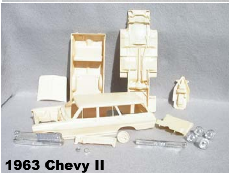
1963 Chevy II