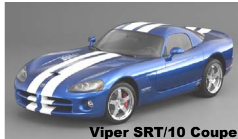
Viper SRT/10 Coupe

Note: Bob Lutz is PO'ed that the press is panning GM's version of the PT Cruiser, and his thinking that he can sell 100,000 of 'em!