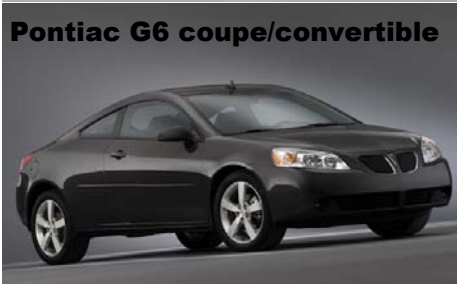
Pontiac G6 coupe/convertible