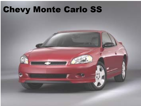
Chevy Monte Carlo SS