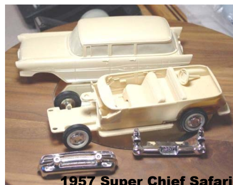
1957 Super Chief Safari