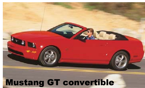
Mustang GT convertible