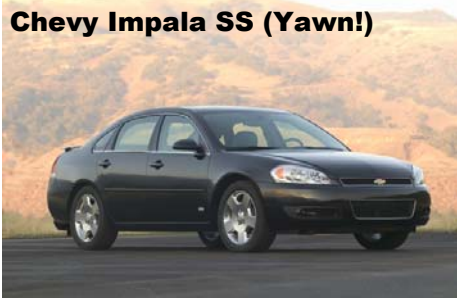
Chevy Impala SS (Yawn!)