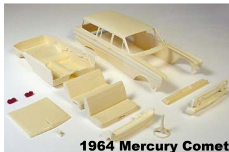
1964 Mercury Comet