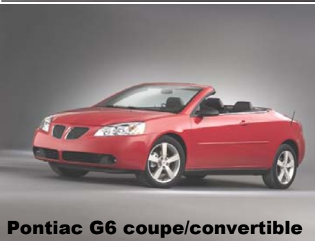
Pontiac G6 coupe/convertible

Note: Bob Lutz is PO'ed that the press is panning GM's version of the PT Cruiser, and his thinking that he can sell 100,000 of 'em!